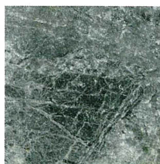
▲ Verde Tumbled stone, £57.57 per sq m, Indigenou.