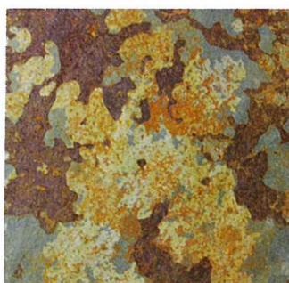
▲ Imperial Slate, from £34.90 per sq m, Fired Earth.