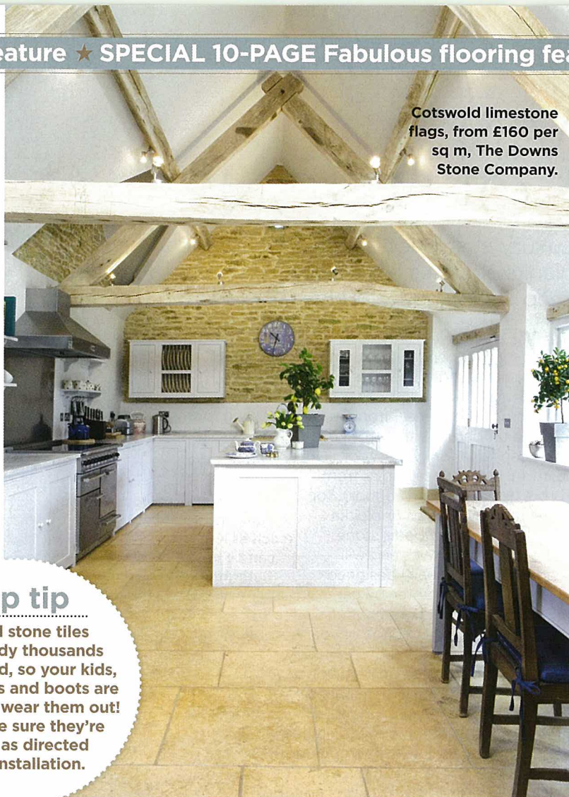
Cotswold limestone flags, from £160 per sq m, The Downs Stone Company.

Ceramic, porcelain, terracotta or stone tiles can be a fabulously practical solution for hardwearing floors and are suitable for any ground-floor space. Porcelain and ceramics are a brilliant alternative to real stone as they are factory-glazed and need no further sealing or polishing – once they're installed all you'll ever have to do is clean them once a week. Choose limestone, granite or slate and they can run through the whole ground floor – from front porch through to hallway, kitchen and even out on to the patio. Terracotta tiles are sometimes factory-sealed or you'll need to apply a coat of sealant once they're laid. Stone tiles are generally supplied unsealed and again, need to be sealed once laid. Renew the sealant every couple of years or so, depending on the wear and tear. Look at sealing and cleaning products by LTP. Silicone sealants are high-performance and prevent dirt and liquid spills from seeping into the pores of stone tiles. Generally, man-made stone tiles don't need sealing.