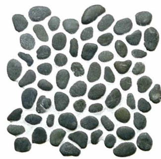
▲ Black Tonga pebble, £56.14 per sq m, Original Style.