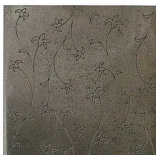
▲ Rustic Metal porcelain, £72 per sq m, Colorker, Tile of Spain.