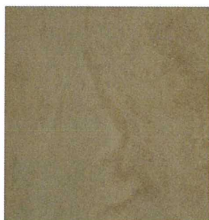
▲ Limestone Silkstone, from £52 per sq m, Taylors Etc.