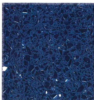
▲ Technistone, £97 per sq m, Haddonstone.