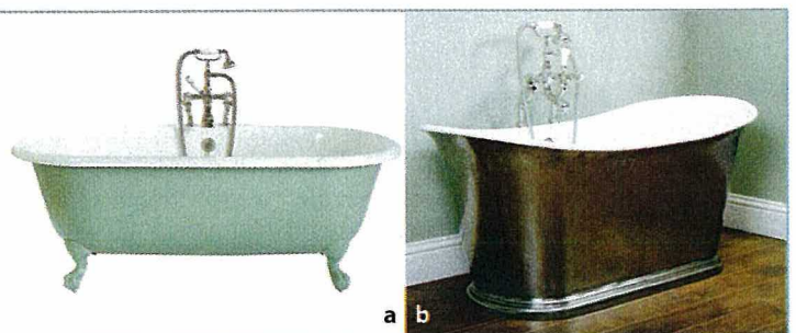
a b c d